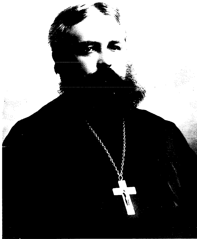
Father Alexis Yurievich Toth