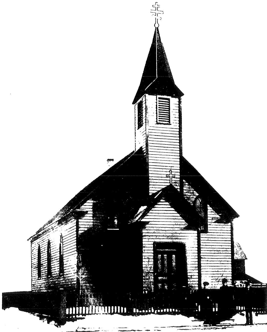
The first wooden Holy Virgin Protectorate Church consecrated in 1889, destroyed by fire in 1904. Replaced in 1905 by the present majestic domed brick structure known as St. Mary's Church or Cathedral.